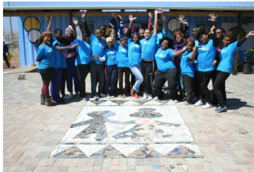
Maintenance of the area: Building a mosaic at the entrance