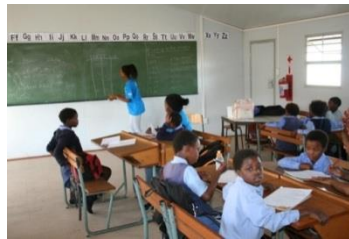
Volunteers teaching Mathematics

programmes. Using the Joe Slovo Primary School classrooms and fields, we offer Cricket, Mathematics and Unity in Africa portfolio projects for Sophakama.