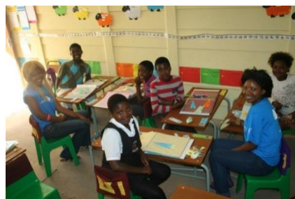
Unity in Africa Portfolio