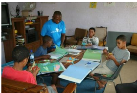
Learners working on their Unity in Africa Portfolio project

Maranatha is a street work action organisation in Port Elizabeth. It cares for vulnerable children and destitute adults in an attempt to restore their human dignity. There are approximately 80 child and adult permanent residents at Maranatha. Their request was for an active life-skills after-school programme to assist with the children’s developmental needs. After the initial assessment and consultations it was decided to implement the Unity in Africa Portfolio project and Sport at the home.