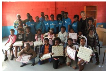
Volunteers at work at ZAMA SA

A special programme has been developed specifically for the learners and NMMU students were trained in how to use the modules in their sessions. Mathematics sessions take place weekly, on a one-on-one basis with learners.