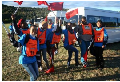
Volunteers at the MTB Challenge