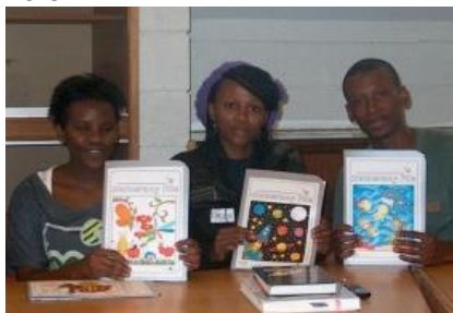
Volunteers at Mathematics training

A special reading programme has been developed specifically for the learners and the NMMU students were trained in how to use the modules in their sessions. Reading takes place weekly, on a one-on-one basis with learners.