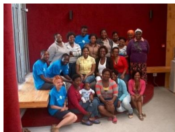
Students and the Women's group at the Red Location Meeting

In collaboration with the Red Location Museum unemployed women in the Red Location were trained in basic business skills. Due to unrest and closure of the museum we were unable to complete the last two classes.