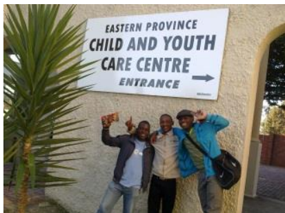
Volunteers at EPCH

In order to encourage “Healthy Body, Healthy Mind”, learners at EPCH are offered the opportunity to develop their netball skills. Students assist with netball coaching and encourage exercising twice a week.